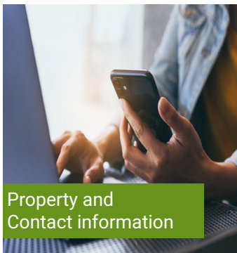
Property and Contact information

Don't worry, we cover all the bases. Here are some things our plan covers to ensure that you are EV ready.