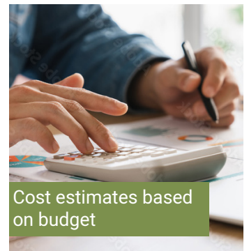
Cost estimates based on budget